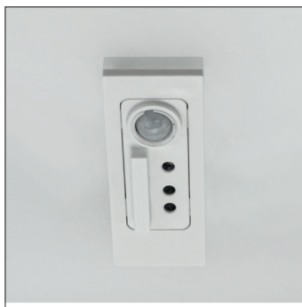
XC daylight&occ sensor

All current index numbers, lumen outputs, power consumption and many other technical information are available in our 2024 pricelist. Details on wireless lighting control systems on page number 896.